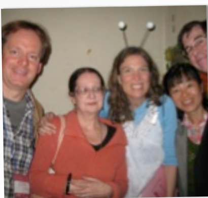
AT LD/CUE/TC DINNER, 2008